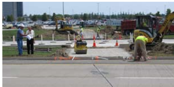
Contractor prepares sub-base and marks the curb where cuts will need to be made in the curb along the perimeter road on the west side of long term parking.

As of September 16, only a few signs and pavement markings stood in the way of the long awaited connection between the Montour Trail and Pittsburgh International Airport. Volunteers were expected to finish those in the weeks that followed (when they weren't working on the Tour the Montour bicycle Ride). Check the Montour Trail website at www.montourtrail.org under “Events” for word on a Grand opening of the 6 mile extension. It “should” be posted not long after you receive this newsletter. We will have full details of the connector in the next issue.