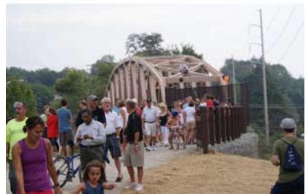
The first walkers reach the south (west) end of the bridge.

The bridge now completes the 2.7-mile Bethel Park branch of the Montour Trail, which has its northern terminus near Irishtown and Logan Roads, and connects with the Arrowhead Trail and the main line of the Montour Trail in Peters Township.