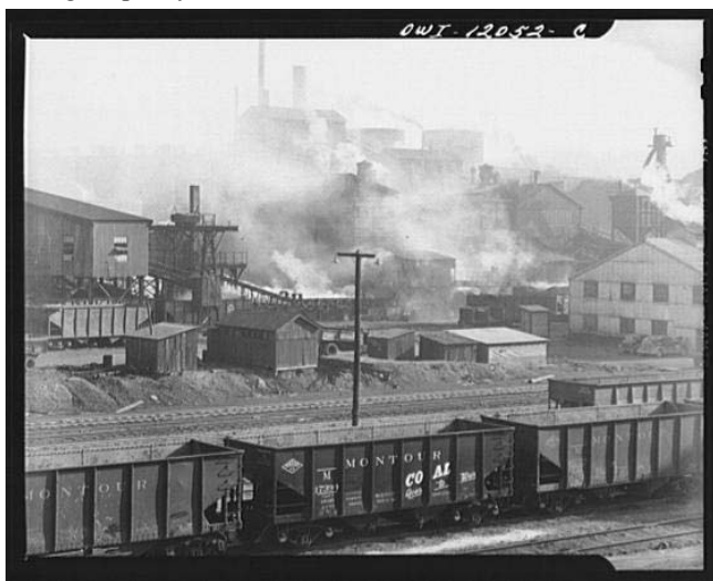
The bustling Champion Preparation Plant as it appeared in 1945. Note the slogan "Coal Goes to War" on Montour hopper #17394.

Our series of historical articles in the Montour Trail Newsletter has continued to emphasize that the Montour Railroad existed because of the billions of tons of Pittsburgh Seam coal that rested beneath the rolling hills and valleys of southwestern Pennsylvania. The data are staggering when you consider that the Montour and its subsidiary, the Pittsburgh & Moon Run Railroad, owned approximately 4,700 gondolas and 3,240 hopper cars, with an aggregate capacity of 287,000 tons of coal, during their 103-year lifetime. The effects of the takeover by the Pittsburgh Coal Company in 1899 and World Wars I (1914-1918) and II (1941-1945) are also evident when you consider that during its 22-years under the ownership of the Imperial Coal Company (1878-1899) the Montour had only 336 cars, but purchased 6,200 cars over the next 45 years.