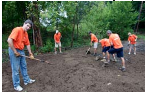
The Airport Friends' Corporate work party with Glaxo/Smith/Kline (GSK) to add the final touch of landscaping.