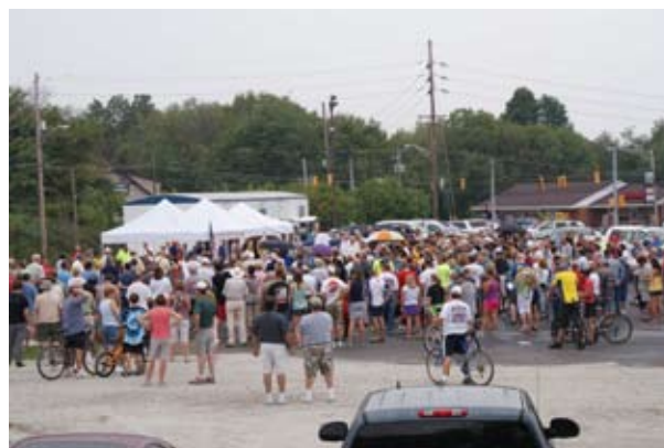
Trail supporters on two feet and two wheels gather in the upper portion of the parking lot at Al's Cafe.

Visit the Montour Trail Web Site at: www.montourtrail.org