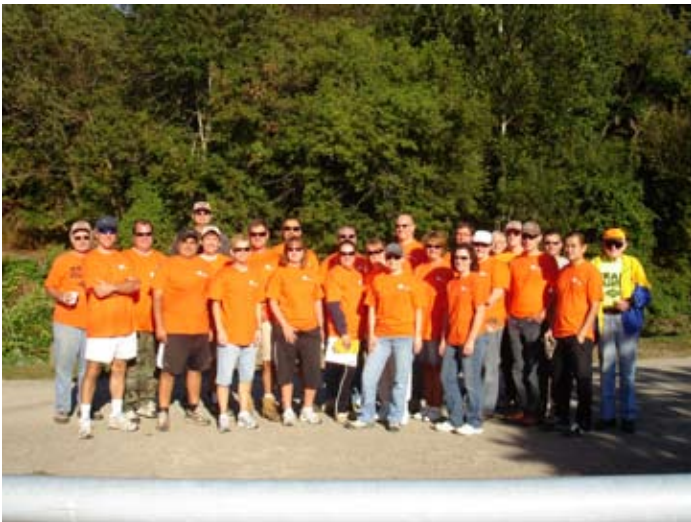
GSK Employees and Airport Friends pose for the obligatory group photo