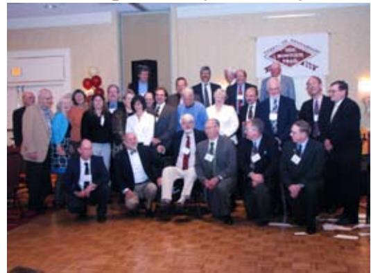
Board members past and present.