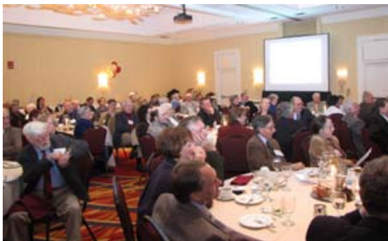
Attendees enjoy the presentation.