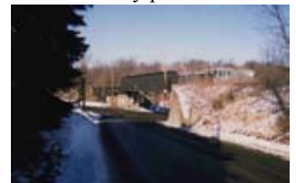
The Venice Railroad Bridge in January 1996.

The Montour Trail had been completed to Cecil Park in 1992, to Venice in 2001, and from the north side of Route 50 to McDonald in 2003. That left a half-mile gap along very busy Route 50, and its treacherous intersection with Route 980. Trail users, those with enough determination to travel through, had to jump into the stream of fast-moving cars and trucks, stay calm, pedal hard and straight, and make a left turn in traffic to get through the gap. (continues on page 4)